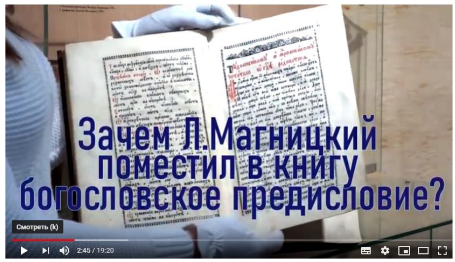
Figure 1. Historical educational video "Magnitsky's Arithmetic"