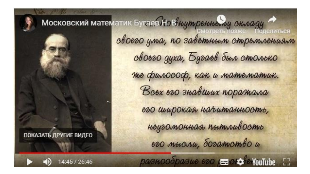
Figure 2. Historical educational video "Moscow mathematician Bugaev N.V."