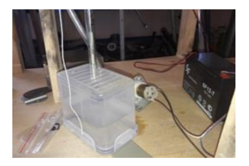
Figure 6 Reservoir assembly (vane pump)