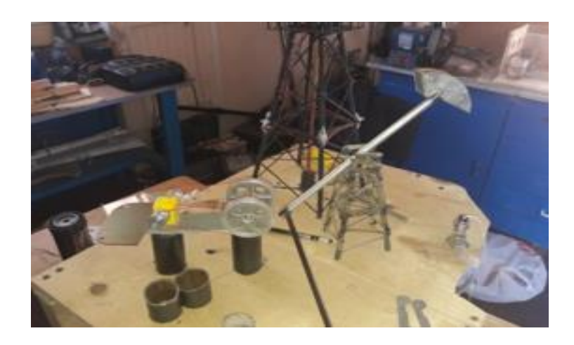
Figure 5 USGN in the assembly (layout)