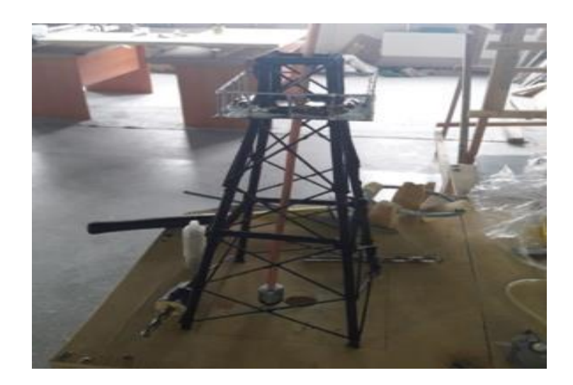
Figure 4 A drilling rig in the Assembly (layout)