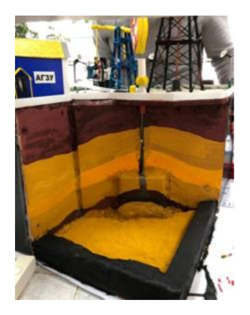
Figure 7 Decorated layermanifold (in the context of)

preparation for the presentation and protection of the project began -multimedia presentation preparation (video) reflecting all stages of manufacturing the layout from design to final design.