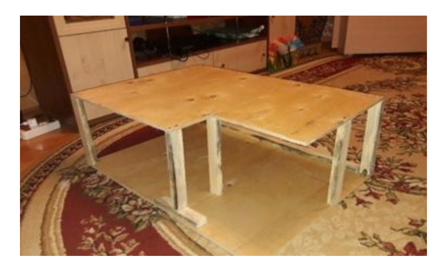
Figure 3 layout Frame in Assembly

installed on the frame (Fig. No. 4), made and fixed ushgn (Fig. No. 5), held and related electronics for lighting and operation of drilling and usgn, developed and assembled the reservoir, from which oil was coming up the bore with impeller pump (Fig. No. 6) and much more. Thus, the result of this stage was an unformed working version of the project.