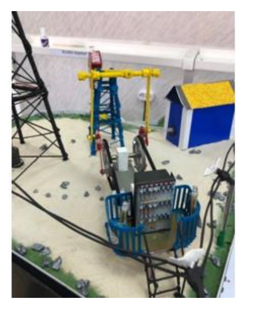
Figure 7 Territory CDG

The project method of training involves the development of theoretical part of a material and makes it possible to more clearly consider the stages of a process or phenomenon. This method is quite difficult to implement, but it contributes to the independent study, development and memorization of all necessary information. It is much more interesting for students to learn the specifics of the future engineering profession in this way, as thanks to the design method they form a deeper understanding of the processes that they will have to deal with in their professional activities. Student groups Ednb-17 took 1 place of honor among the projects presented at the seminar.