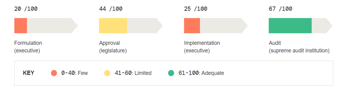
Fig. 2. Extent of opportunities for public participation in the budget process.

Ukraine has a public participation score of 39 (out of 100).