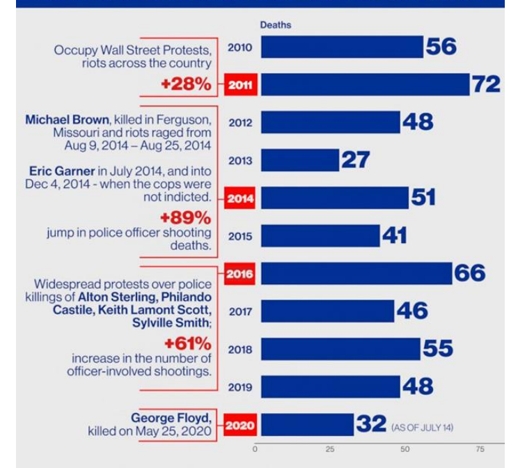
Figure 1. Police officers killed in the line of duty in the United States of America.

Being a federal state, the United States recognize assault and other illegal actions against public officials as a crime both on a federal and state levels. We will start with the federal legislative approach.