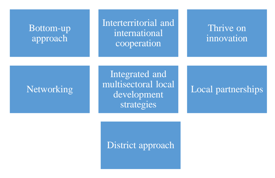
Figure 4. Main components of the LEADER approach for testing in Ukraine (identified by the author)

allocation (Figure 4). This approach has an added value, which is connected with the extended opportunities and rights at the local level through the development, implementation and allocation of resources at the local level. The LEADER approach has been further developed through extension. Community-led local development (CLLD) were formed in various agglomerations, as well as communities related to fishing. Financing was carried out during 2014-2020.