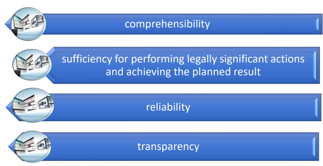
Figure 3. Features of legally relevant electronic information.

Courts can use legally significant electronic messages to establish the truth in the context of conflict resolution, disputable situations related to the need to develop a concerted solution or proof (Kirillova, Bogdan, 2018). Legally relevant information available on the Internet can be defined as data having fixed forms of external manifestation, entailing legal consequences and contributing in one way or another to governing certain relations.