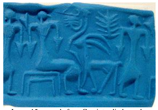
Image 15 a sample from Cypriot cylinder seals. (http://www.antiques.com/classified/Antiquties/Ancient-Near-East/Antique-2-Ancient-Cyprus-Limestone-Cylinder - Seals. 2016)

worked. On this composition too, no separators are used.