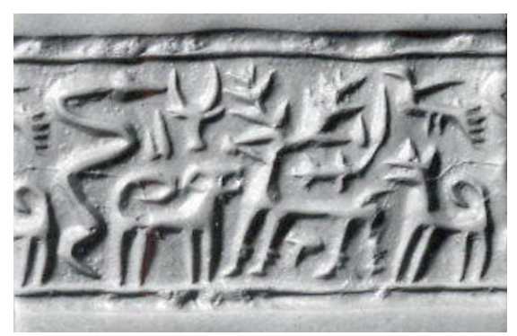
Image 45 a sample from The Metropolitan Museum, cylinder seals. (http://www.metmuseum.org/collection/the-collection-online/search/327819, 2014)

other and no separators are used on this composition between the figures. The working area is bordered on top and bottom by a line and a band.