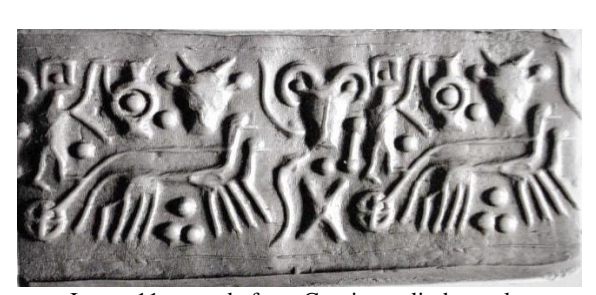
Image 11a sample from Cypriot, cylinder seals. (Karageorghis,2002)

Again, no separators are used on this composition.