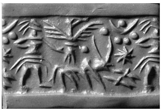
Image 16 a sample from The Metropolitan Museum, cylinder seals. (http://www.metmuseum.org/collection/the-collection-online/search/327819, 2014)

20. In Image 16, in addition to the main scene, two more figures and three motifs are scraped vertically and without any separators.