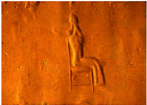
Image 63 a sample from The British Museum, cylinder seals. (http://www.britishmuseum.org/research/publications/online_research_catalogues/ancient_cyprus_british_museum. aspx.2013)

15. Image 63, is a sample of a cylinder seal composition on which only one figure is worked.