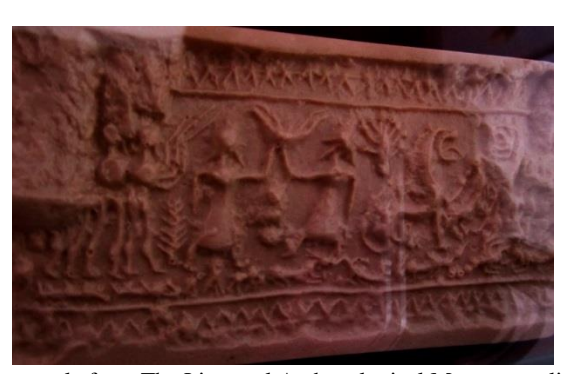
Image 37 a sample from The Limassol Archaeological Museum, cylinder seals.

motifs are worked. On this composition, no separators are used between the figures.