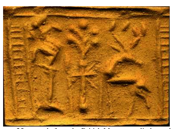
Image 25 a sample from the British Museum, cylinder seals. (http://www.britishmuseum.org/research/publications/online_research_catalogues/ancient_cyprus_british_museum.aspx.2013)

composition and it also bordered by two lines on the top and bottom.