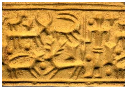
Image 35 a sample from the British Museum, cylinder seals. (http://www.britishmuseum.org/research/publications/online_research_catalogues/ancient_cyprus_ british_museum. aspx.2013)

6e. In Image 36, the working area is bordered at the top and bottom by a band and a thin line together. Two figures are worked on this