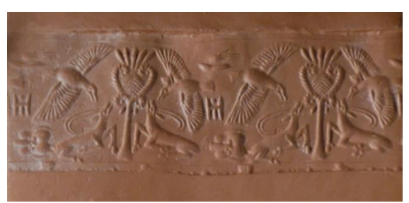
Image 49 a sample from The Louvre Museum, cylinder seals. (http://en.wikipedia.org/wiki/Engraved_gem,2017)

figures and motifs are so mixed that it might actually not be easy to use separators. The working area is bordered by lines, but there are dots on this line.