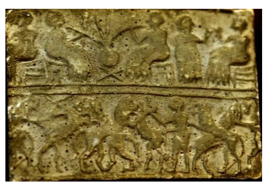
Image 31 a sample from The Cyprus Museum, cylinder seals.

parallel lines. Between the figures and motifs worked on both parts, no separators are used.