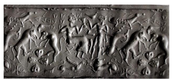
Image 68 a sample from the Cypriot cylinder seals. (Karageorghis, 2002)

20b. In Image 69, a composition is presented where the figures are scraped on the working area, one on the top of the other or side-by-side