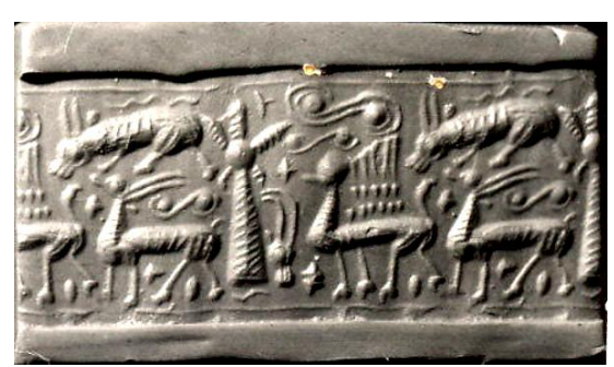
Image 12 a sample from The Metropolitan Museum, cylinder seals. (http://www.metmuseum.org/collection/the-collection-online/search/327819, 2014)

one on top of the other, without the use of any separators.