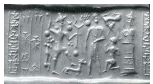
Image 56 a sample from The Metropolitan Museum, cylinder seals. (http://www.metmuseum.org/collection/the-collection-online/search/327819, 2014)

14. Cylinder seal compositions where the sub-scene is divided or bordered by motifs. This group of seals is divided into subgroups.