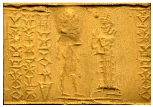
Image~55~a~sample~from~The~British~Museum,~cylinder~seals.\\ (http://www.britishmuseum.org/research/publications/online_research_catalogues/ancient_cyprus_~british_museum.\\ aspx.~2013)

columns are three and there are no separators between the letter columns.