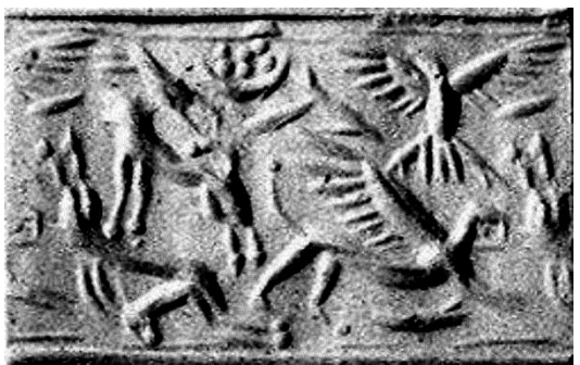
Image 13 a sample from The Metropolitan Museum, cylinder seals. (http://www.metmuseum.org/collection/the-collection-online/search/327819, 2014)

other, but vertically. Again, no separators are used on this composition.