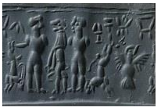
Image 21 a sample from The Metropolitan Museum, cylinder seals.

this composition, it is likely that it was not necessary to use more figures.