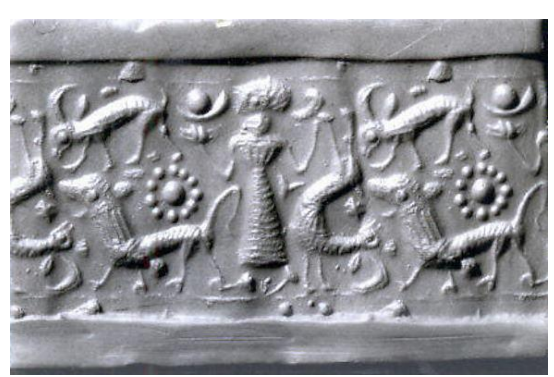
Image 22 a sample from The Metropolitan Museum, cylinder seals. (http://www.metmuseum.org/collection/the-collection-online/search/327819,2014)

added an element of decoration to the presentation. On this composition too, no separators are used.