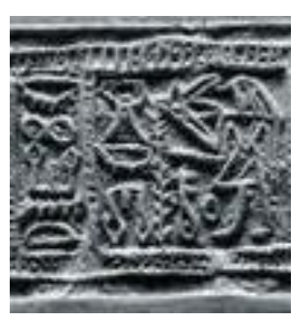
Image 34 a sample from The Metropolitan Museum, cylinder seals.

five motifs are worked. On this composition, no separators are used between the figures and motifs.