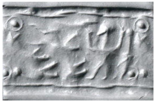
Image 27 a sample from The Metropolitan Museum, cylinder seals. (http://www.metmuseum.org/collection/the-collection-online/search/327819, 2014)

between these figures. Although there are a small number of figures, the working area is well filled. This composition is bordered by a continuous line, while at the top, there is a dashed line.