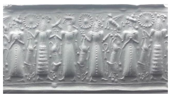
Image 1.A sample from The Cyprus Museum, cylinder seals.

used to fill the gaps on the working area are not at the same level.