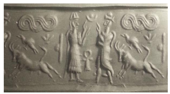
Image 57 a sample from The Cyprus Museum, cylinder seals.

14a. In Image 57, in addition to the main scene, two figures are worked one on top of the other and a triple braid is worked at the very top. On this composition, no separators are used between the figures.