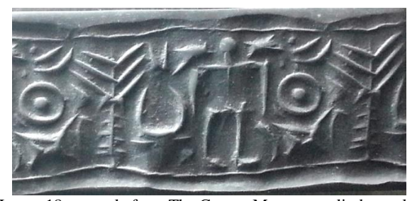
Image 18 a sample from The Cyprus Museum, cylinder seals.

are worked on top of each other. The main figures are worked with such size that the secondary figures fill the rest of the area and there was no need to include more figures or motifs. This composition is bordered by two large bands.