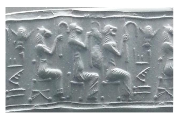
Image 2.A sample from The Cyprus Museum, cylinder seals.

2a. In Image 2, in addition to the main scene, some other figures is scraped differently to each other and without any separations. The whole composition is bordered by two thin lines at the top and bottom. The main scene figures are looking in the same direction.