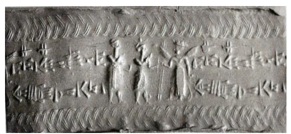
Image 33 a sample from Cypriot cylinder seals. (Karageorghis, 2002)

motifs are worked on this composition. The letters are worked in a parallel mode.