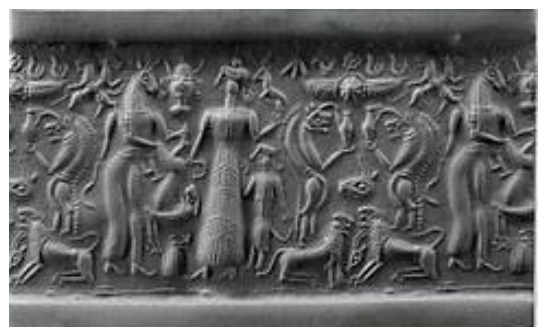
Image 48 a sample from The Metropolitan Museum, cylinder seals. (http://www.metmuseum.org/collection/the-collection-online/search/327819, 2014)

On this composition too, no separators are used.