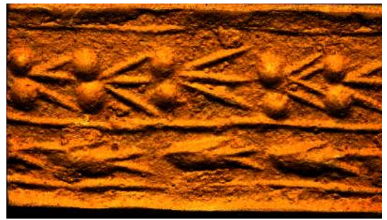
Image 29 a sample from the British Museum, cylinder seals. (http://www.britishmuseum.org/research/publications/online_research_catalogues/ancient_cyprus_ british_museum. aspx.2013)

5c. In Image 30, the working area of the seal is divided into two unequal parts with a line of dots. In both parts, many figures are scraped. The