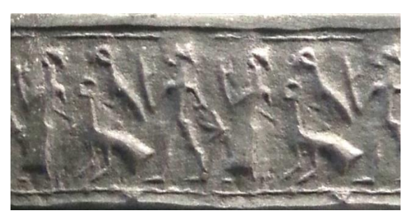
Image3. Asample from The Cyprus Museum, cylinderseals.

separation between the basic two figures. All the figures are looking in the same direction.