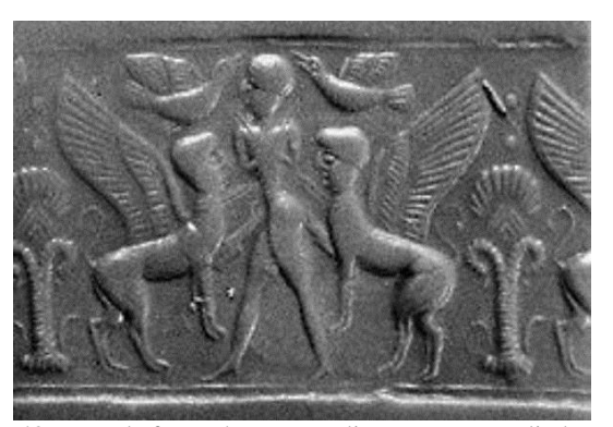
Image 43 a sample from The Metropolitan Museum, cylinder seals. (http://www.metmuseum.org/collection/the-collection-online/search/327819, 2014)

bottom and two figures at the top are worked. No separators were used on this composition.