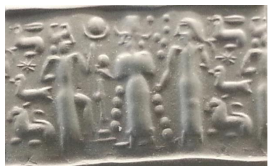
Image 8 a sample from The Cyprus Museum, cylinder seals.

prominent, the scraper may have found it unnecessary to use larger figures as it could have overcrowded the scene.