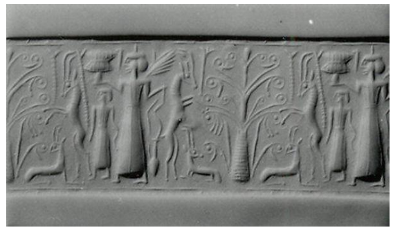
Image 47 a sample from The Cyprus Museum, cylinder seals.

In image 48, in addition to the main scene, two rows of figures and motifs are worked over each other vertically.