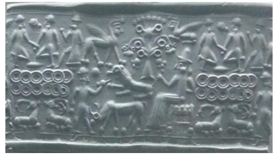
Image 60 a sample from The Cyprus Museum, cylinder seals.

both of these two parts, two figures above the circled motifs and three figures below the circled motifs are worked.