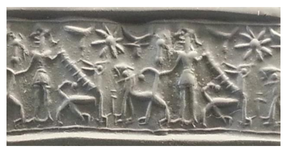
Image5. Asample from The Cyprus Museum, cylinderseals.

scraped and at the top, another three figures are scraped. Again, the whole scene is bordered by two thin lines.