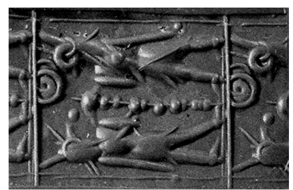
Image 65 a sample from The Metropolitan Museum, cylinder seals. (http://www.metmuseum.org/collection/the-collection-online/search/327819, 2014)

18. In Image 66, the seal is worked as a triangular prism and in triplet shape. Also, triptych (triple print) printing is