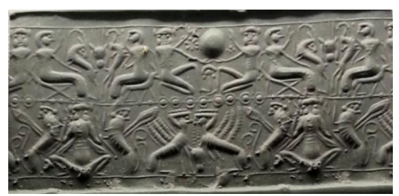
Image 28 a sample from The Cyprus Museum, cylinder seals.

into two equal parts by a line on which, circleddots are worked on this dividing line. The figures on the upper part are different than the figures in the lower part. In both, the groups of figures are worked almost symmetrically. No other separators are used between the figures.