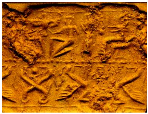
Image 30 a sample from the British Museum, cylinder seals. (http://www.britishmuseum.org/research/publications/online_research_catalogues/ancient_cyprus_ british_museum. aspx.2013)

composition is bordered by two thin lines on the bottom and on the top.