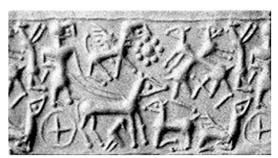
Image 67 a sample from The Metropolitan Museum, cylinder seals. (http://www.metmuseum.org/collection/the-collection-online/search/327819, 2014)

are worked that are not touching, but the top three figures are combined with each other. On this composition, more motifs are used to fill the working area.