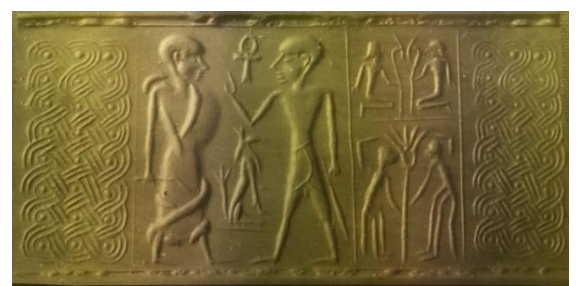
Image 46 a sample from The Cyprus Museum, cylinder seals.

figures are worked. Also, a triple braid motif is worked vertically to complete the composition