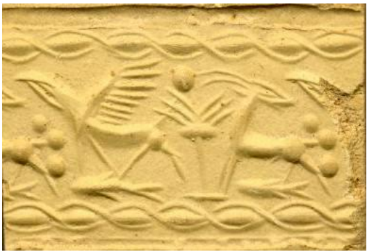
Image 32 a sample from the British Museum, cylinder seals. (http://www.britishmuseum.org/research/publications/online_research_catalogues/ancient_cyprus_ british_museum. aspx.2013)

6b. In Image 33, the working area of the cylinder seal is bordered by two decorative motifs. On the main scene, figures and Sumerian-like letters or