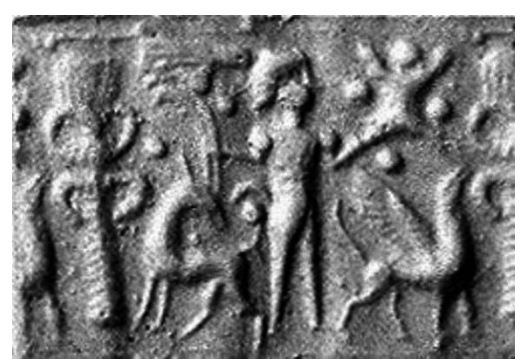
Image 7.A sample from The Metropolitan Museum, cylinder seals. (http://www.metmuseum.org/collection/the-collection-online/search/327819, 2014)

2g. In Image 8, in addition to the main scene, three figures and one motif are worked and on this sample, no separations are used in the composition. Since the main figures are