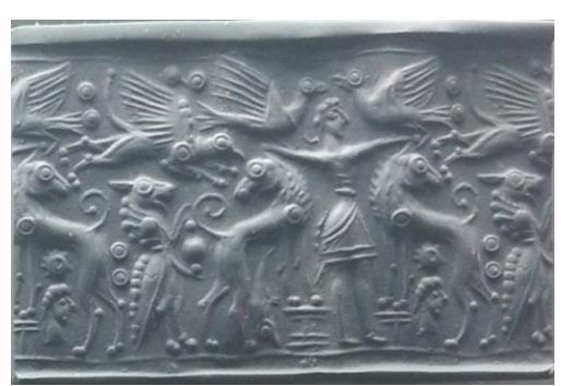
Image 40 a sample from The Cyprus Museum, cylinder seals.

7a. In Image 40, the main figure is worked at the centre of the working area. On both sides, symmetrical groups of binary figures are worked. Also, at the top, several symmetrical figures are also worked and no separators are used on this composition