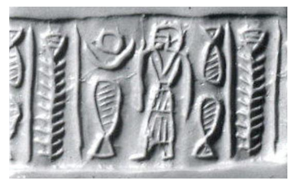
Image 23 a sample from The Metropolitan Museum, cylinder seals. (http://www.metmuseum.org/collection/the-collection-online/search/327819,2014)

3b: In Image 24, in addition to the main scene, on the right two figures are worked over each other, without any separator. However, on the left side, two figures are worked side by side, which are