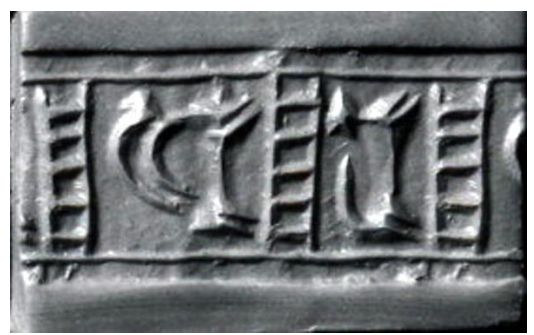
Image 36 a sample from The British Museum, cylinder seals. (http://www.britishmuseum.org/research/publications/online_research_catalogues/ancient_cyprus_ british_museum. aspx.2013)

composition, where the figures are separated by ladder-like separators.