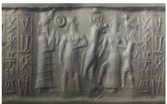
Image 51 a sample from The Cyprus Museum, cylinder seals.

13a. In Image 51, the main scene is placed on the floor and consists of five figures. In the vertically separated columns, letters and scripts are worked.