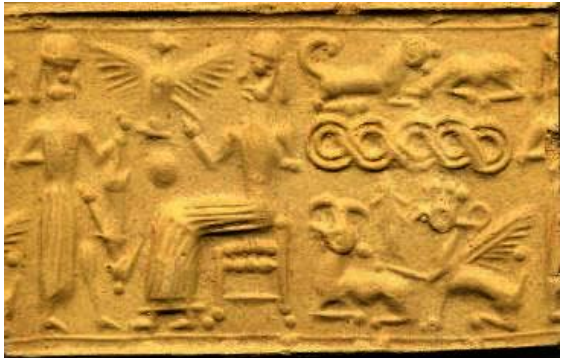
Image 62 a sample from The British Museum, cylinder seals. (http://www.britishmuseum.org/research/publications/online_research_catalogues/ancient_cyprus_ british_museum. aspx.2013)

15. Image 63, is a sample of a cylinder seal composition on which only one figure is worked.