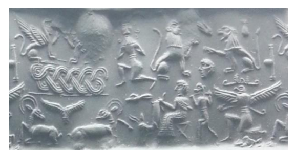
Image 59 a sample from The Cyprus Museum, cylinder seals.

14d. In the working area of image 60, in addition to the main scene, a sub-scene is worked, which is divided into two parts with two sets of circled motifs over each other. On this composition, in