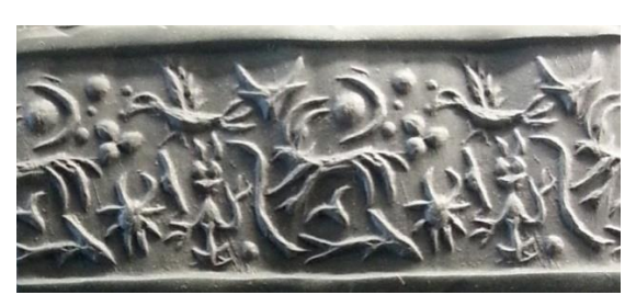
Image 69 a sample from The Cyprus Museum, cylinder seals.

and they are particularly numerous. It can be said that this used a mixed mode.