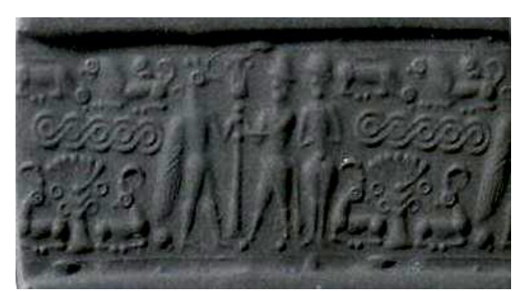
Image 61 a sample from The Metropolitan Museum, cylinder seals. (http://www.metmuseum.org/collection/the-collection-online/search/327819, 2014)

a braid motif, where two figures above the braid and three figures below the braid are worked.