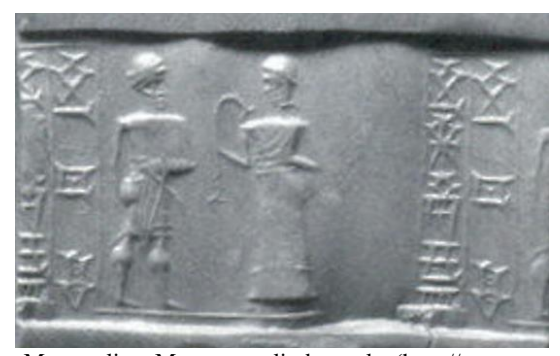
Image 54 a sample from The Metropolitan Museum, cylinder seals. (http://www.metmuseum.org/collection/the-collection-online/search/327819, 2014)

main scene figures, two columns of letters are worked, which are separated by vertical lines that complete the two rectangles on the composition.