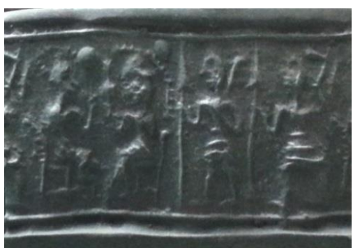
Image 38 a sample from The Cyprus Museum, cylinder seals.

6h. In Image 39, the working area is again bordered by double lines. The inner lines also complete the vertical separation lines to create smaller rectangular working areas. In these