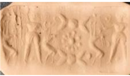
Image 6. A sample from The Johns Hopkins Museum, cylinder seals. (http://archaeologicalmuseum.jhv.edu/the-collection/object-stories/cylinder-seals-from-the-ancient-near-east/late-bronze-age-cyprus.2015)

figures are scraped on top of each other, where no separation was used.