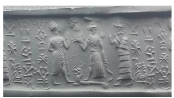
Image 52 a sample from The Cyprus Museum, cylinder seals.

to the main figures, letters and scripts are worked without any separators.