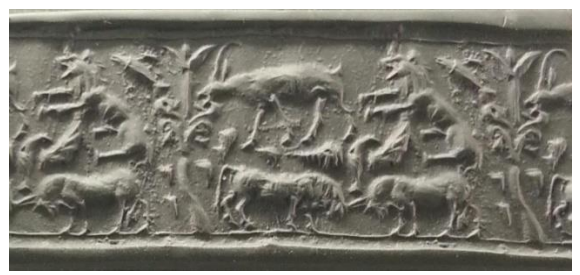
Image 42 a sample from The Cyprus Museum, cylinder seals.

direction. No separators are used on this composition. In fact, in this composition, all the figures are touching each other, meaning that separation seems impossible.