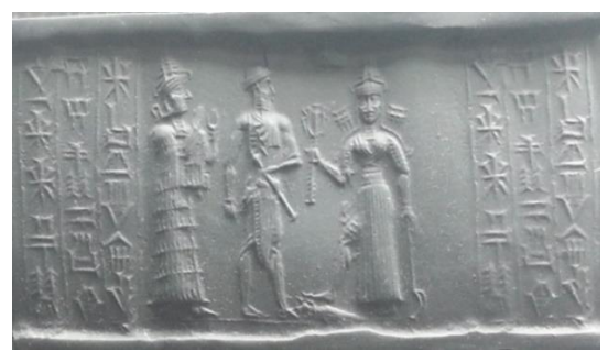
Image 53 a sample from The Cyprus Museum, cylinder seals.

13d. In Image 54, the main scene is worked at the centre of the working area and the main two figures are placed on a stand or platform parallel to the floor of the composition. In addition to the