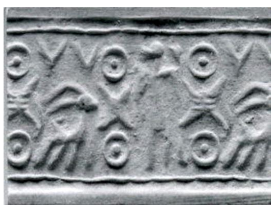
Image 19 a sample from The Metropolitan Museum, cylinder seals. (http://www.metmuseum.org/collection/the-collection-online/search/327819, 2014)

this composition and the whole area sufficiently filled that no more figures were needed. Here, the composition is bordered by double lines at the top and a single line at the bottom.