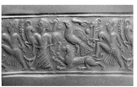
Image 9 a sample from The Metropolitan Museum, cylinder seals. (http://www.metmuseum.org/collection/the-collection-online/search/327819, 2014)

any separation, and the whole scene is bordered by two very smooth lines.