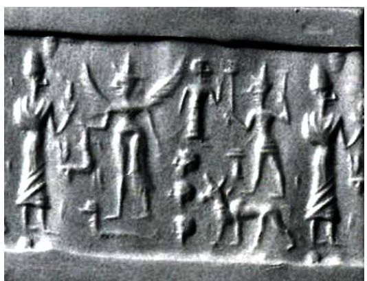
Image 17 a sample from The Metropolitan Museum, cylinder seals. (http://www.metmuseum.org/collection/the-collection-online/search/327819, 2014)

2r. In Image 18, in addition to the main scene, in vertical mode and in three different rows, three, one and two motifs or figure groups is worked. No separators are used between the figures, motifs or groups. The figures on this composition