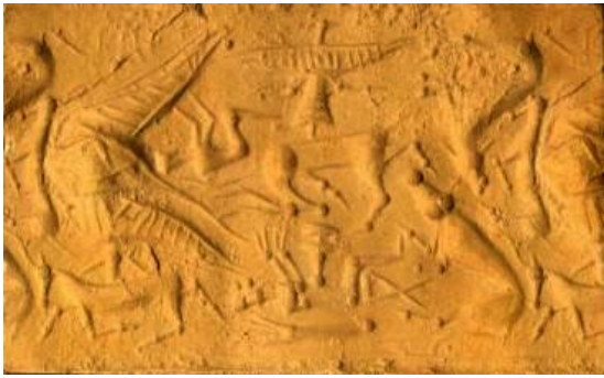
Image 70 a sample from the British Museum, cylinder seals. (http://www.britishmuseum.org/research/publications/online_research_catalogues/ancient_cyprus_ british_museum. aspx.2013)

each-other. This composition is also a "mixed" one, with plenty of figures and motifs.