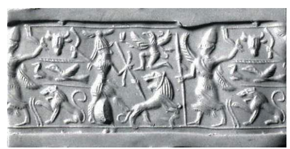
Image 24 a sample from The Metropolitan Museum, cylinder seals. (http://www.metmuseum.org/collection/the-collection-online/search/327819,2014)

separated and bordered from other figures. The whole composition is bordered by two lines at the bottom and at the top.