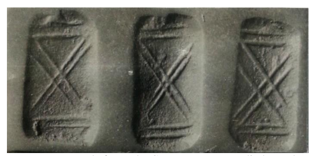
Image 66 a sample from The Cyprus Museum, cylinder seals.

used where the top and bottom are bordered by double-lines.