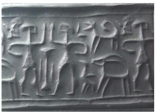
Image 4.A sample from The Cyprus Museum, cylinder seals.

separation is used and both the bottom and the top of the total scene are bordered by two thin lines.