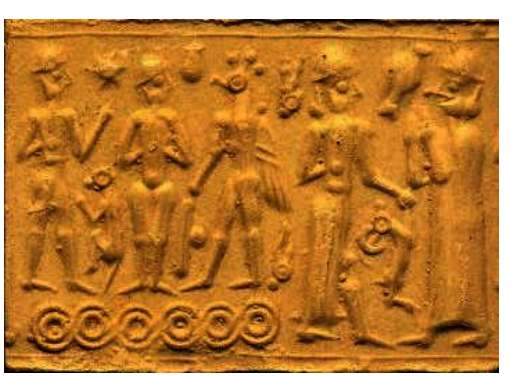
Image 58 a sample from The British Museum, cylinder seals. (http://www.britishmuseum.org/research/publications/online_research_catalogues/ancient_cyprus_ british_museum. aspx.2013)

the main one. No separators are used on this composition between the figures.