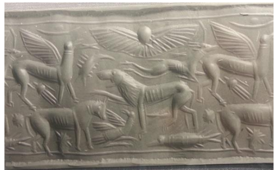
Image 44 a sample from The Cyprus Museum, cylinder seals.

7f. In Image 45, the main figure is worked at the centre of the working area. Two figures are worked at the front and two behind. In the front of the main figure, another figure (snake) is worked. All the figures are different from each