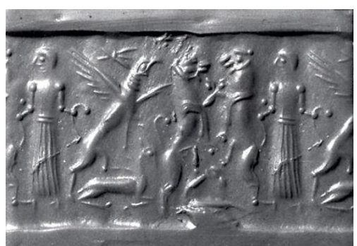
Image 20 a sample from The Metropolitan Museum, cylinder seals. (http://www.metmuseum.org/collection/the-collection-online/search/327819, 2014)

2u. In Image 21, in addition to the main scene, two figures are worked at the bottom and four motifs at the top without using any separators. On